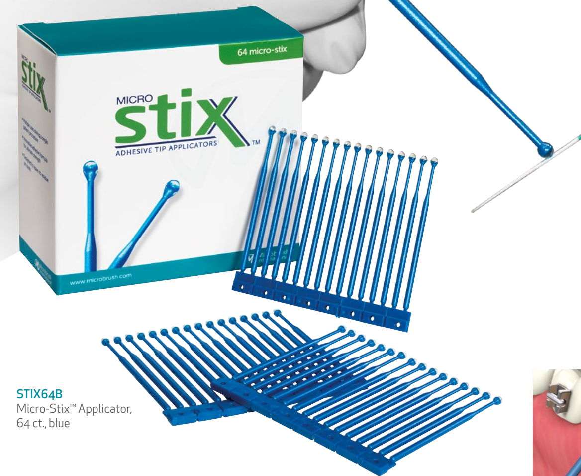
STIX64B Micro-Stix™ Applicator, 64 ct., blue